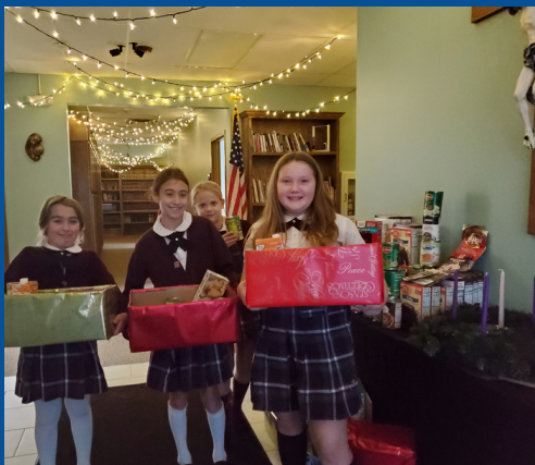
Light of Christ Academy held a food drive for Bread of Life.