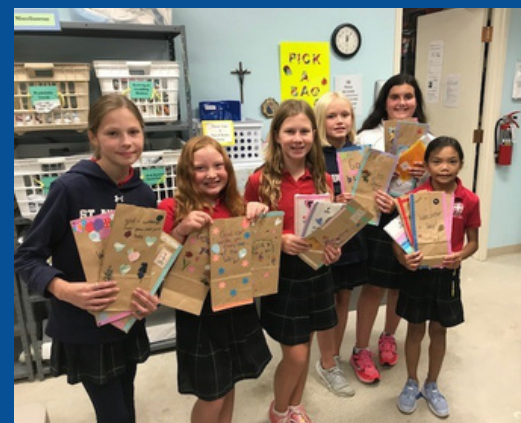
St. Augustine students volunteer regularly at Caring Network and help with donation drives.

Celebrate Catholic Schools Week January 28 through February 3, 2024