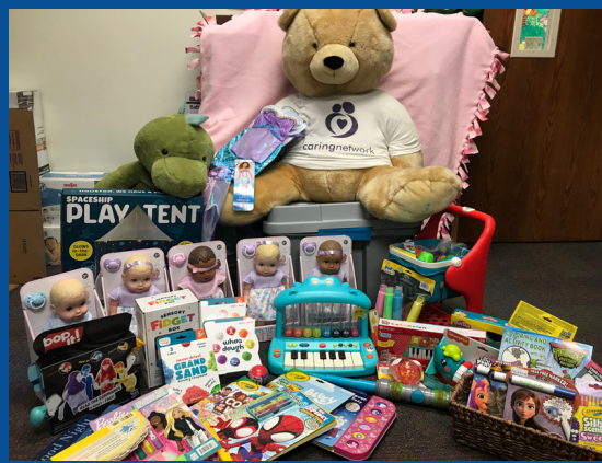
St. Monica students raised money to purchase Christmas gifts for Caring Network families.